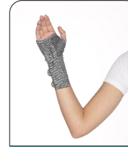
Wrist Splint Ambidextrous