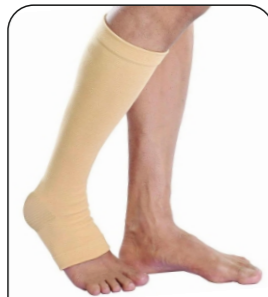
Varicose Vein Stockings - Classic