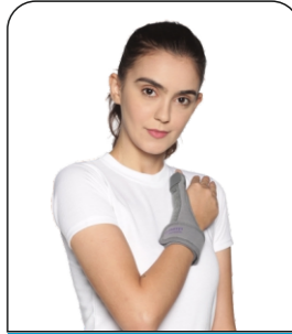
Thumb Spica Splint