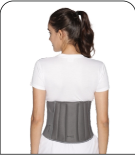
Lumbo Sacral Belt