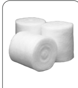
Acti Pad (Cast Padding)