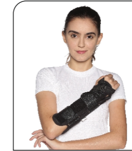
Wrist & Forearm Splint [Ambidextrous]