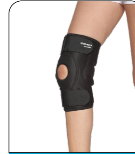
Knee Support Hinged