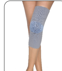
Knee Support 3D