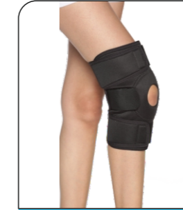
Knee Support Open Patella