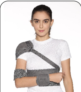
Shoulder Immobilizer Premium