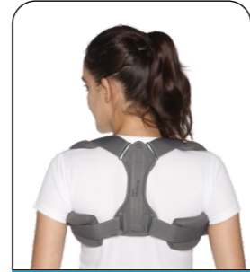
Clavicle Brace 4 Way