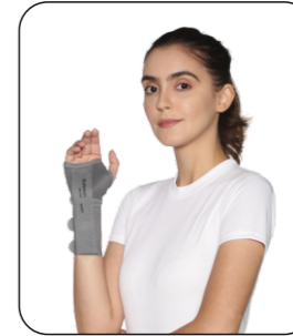
Wrist Splint [Left/Right]