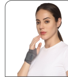
Wrist Brace With Thumb