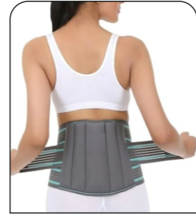
Lumbo Sacral Belt Contoured Premium