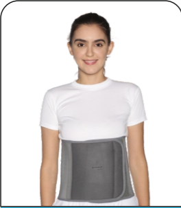
Abdominal Corset 8,9 Inches