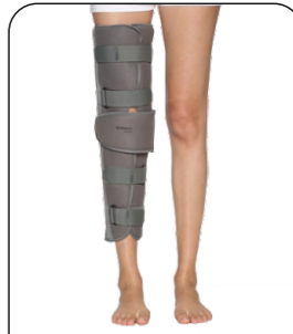
Knee Immobilizer 24 Inches