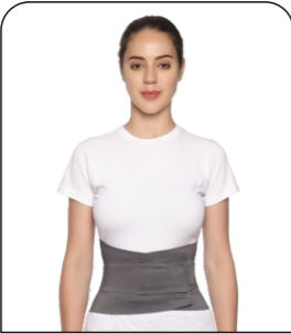
Lumbo Sacral Belt Contoured