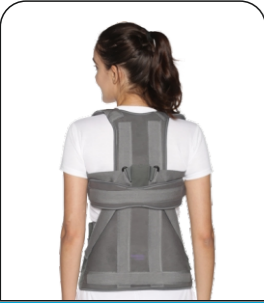
Taylor's Brace Short / Long