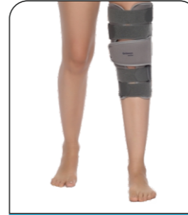
Knee Immobilizer 14 Inches