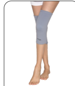
Knee Support Economy Pair