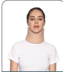
Cervical Collar Soft without Support