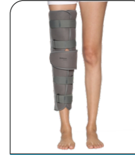
Knee Immobilizer 19,22 Inches