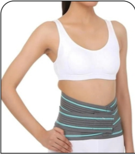
Lumbo Sacral Belt Premium