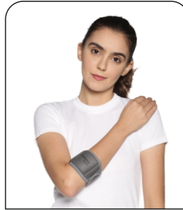
Tennis Elbow Support