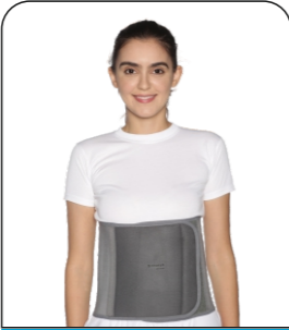
Abdominal Corset 10 Inches