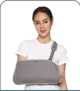
Pouch Arm Sling Premium