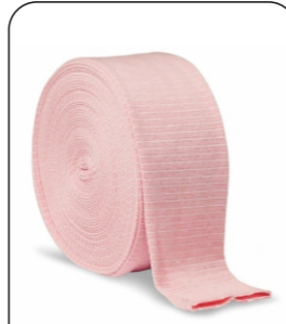
Elasticated Tubular Bandage

Size : 6.25CM, 6.75CM, 7.5CM, 8.75CM, 10CM, 12CM X 5 MTS