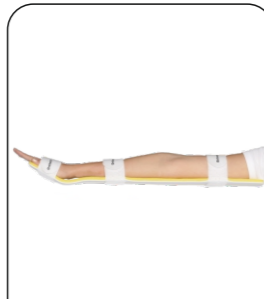
Long Arm Splint