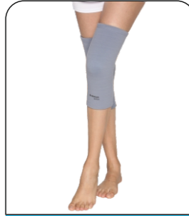
Knee Support Pair