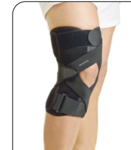
OA Knee Brace