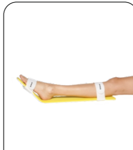
Short Leg Splint