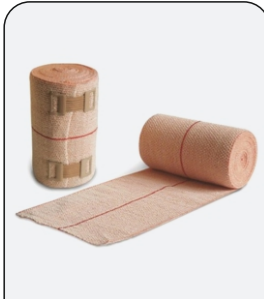
Elastic Crepe Bandage