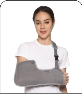
Pouch Arm Sling Regular