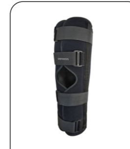
Knee Immobilizer Three Panel